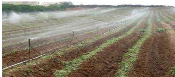
Fig. 3 Sprinkler irrigation

In sprinkler irrigation, water is piped to one or more central locations within the field and distributed by overhead high-pressure sprinklers or guns. A system utilizing sprinklers, sprays, or guns mounted overhead on permanently installed risers is often referred to as a solid-set irrigation system. Higher pressure sprinklers that rotate are called rotors and are driven by a ball drive, gear drive, or impact mechanism. Sprinkler systems are classified into two major types based on the arrangement of spraying irrigation water.