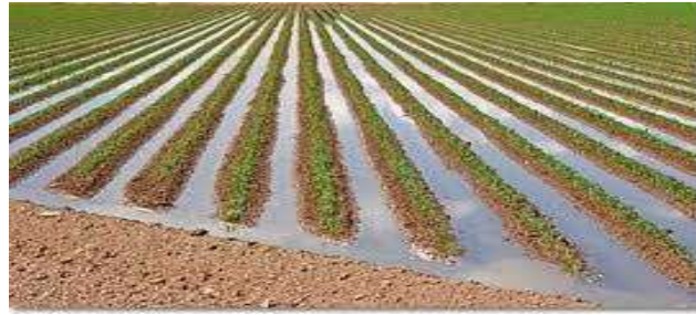
Fig. 1. Surface Irrigation